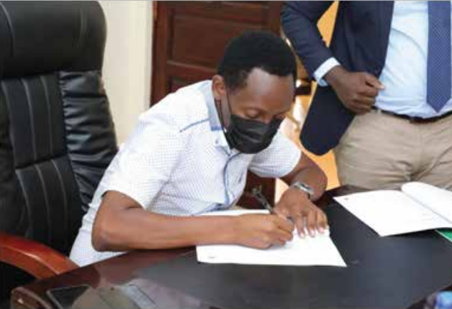
Signing of Cooperation Agreement with the County Government of TaitaTaveta